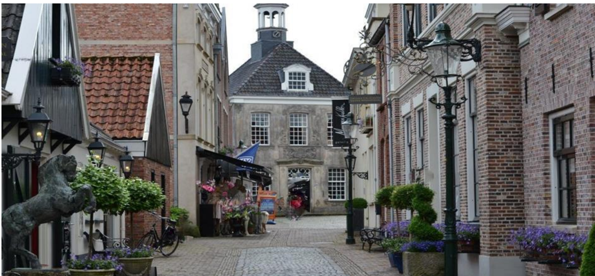
Ootmarsum ( Netherlands)

On to Ootmarsum . A town (from about 1300) with a protected townscape in which 30 national monuments.