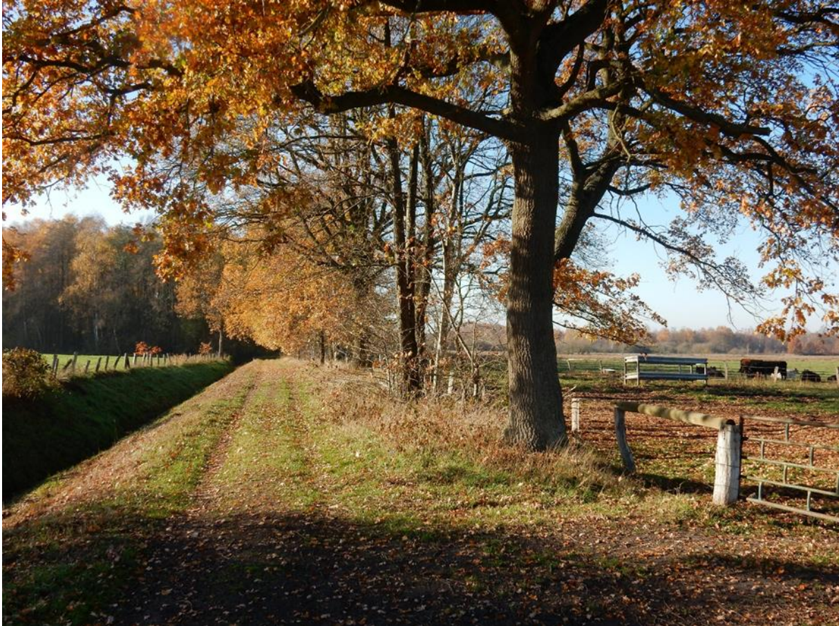
Aamsveen border, in autumn