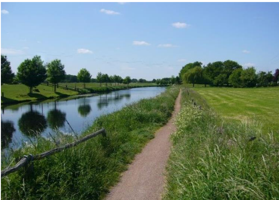
Bocholt Aa river

Via the Bocholter Aa (strang) we leave the city. Along a beautiful hiking and biking path next to the river.