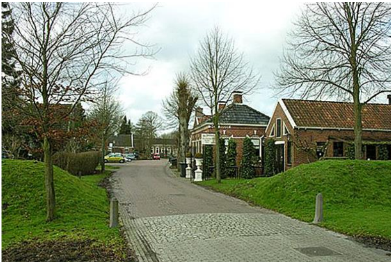
Oudeschans ( ramp, a fortress) 1593

The clay fields and meadows continue until just south of Oudeschans . Where the sand and peat lands begin. Bellingwolde : an attractive regional village with a protected townscape. Monumental mansions and farms. With the necessary Art Nouveau features. And a very old church from the 16th century.