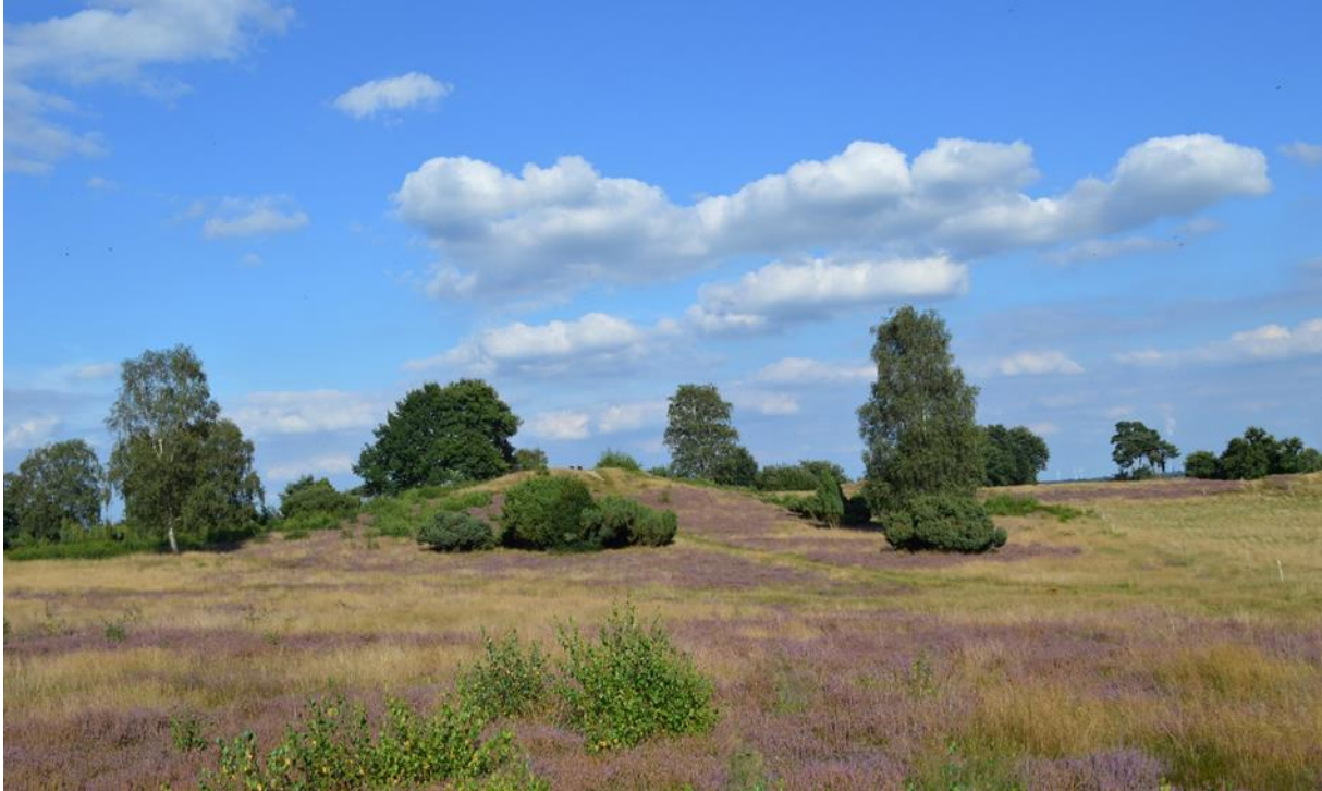
Tomb mound near Uelsen (Germany)