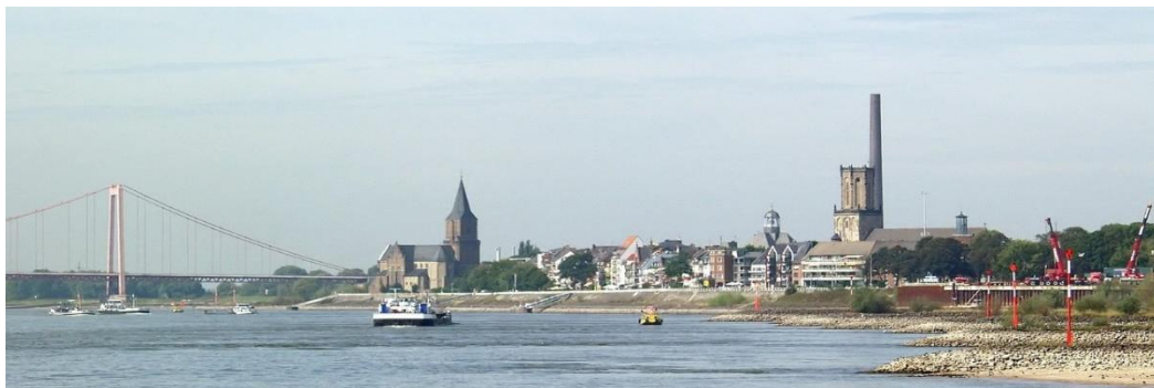
Emmerich am Rhein (Rhine)

In Emmerich (Germany) you can get on the train, to....?