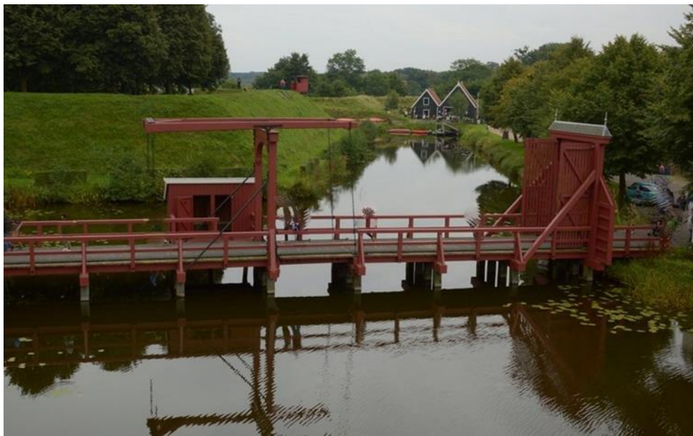
The entrance to Fort Boertange (village) 1580

At Wollinghuzen you turn off in the direction of Bourtange . A fortified village that was built during the Revolt. Or 80-year war. A village in the Bourtange Moor, the only place - on a tange , a stretch of firmer sand - where you could pass through the area towards Groningen. Of strategic importance, in other words. For example, to isolate the Spaniards in Groningen. Before you walk into the fortress, you can take a loop walk east of the village. An area with sparse grassland and low bushes. A bird-rich area. The adder has also been spotted there!