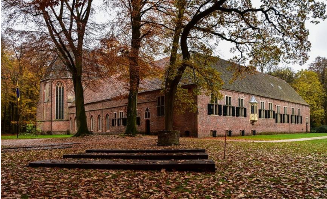
Monastery Museum ter Apel

The route continues through peat-colonial farmlands. Excavated bogs, straightforward land development. You are in Drente.