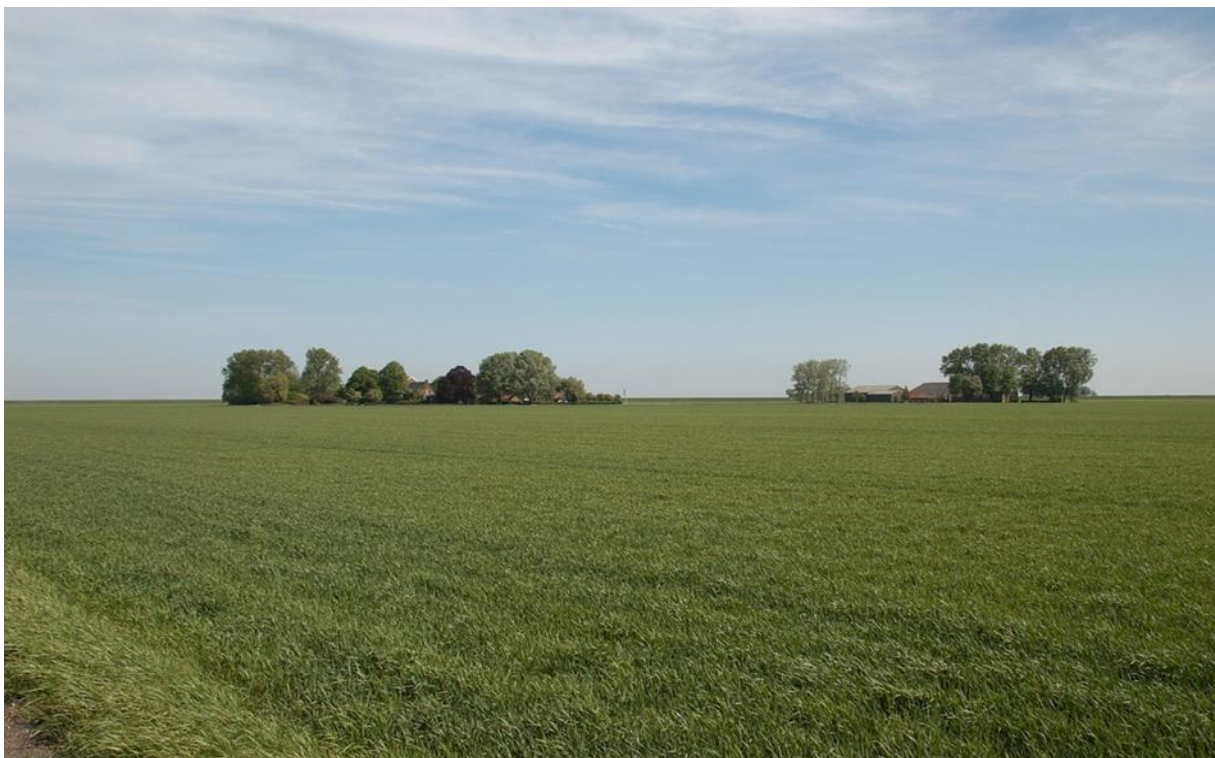
Vastness of the landscape

Transportation: both Nieuweschans and Emmerich can be reached by train. For the intermediate stage locations it is a matter of further research at home. Bus stops are indicated on the maps But that may change! There is a fast train running between Schiphol airport and Groningen: 3 hrs. Groningen - Nieuweschans: 1 hrs. by local train. A fast train between Emmerich and Schiphol is running. About 2 hrs.