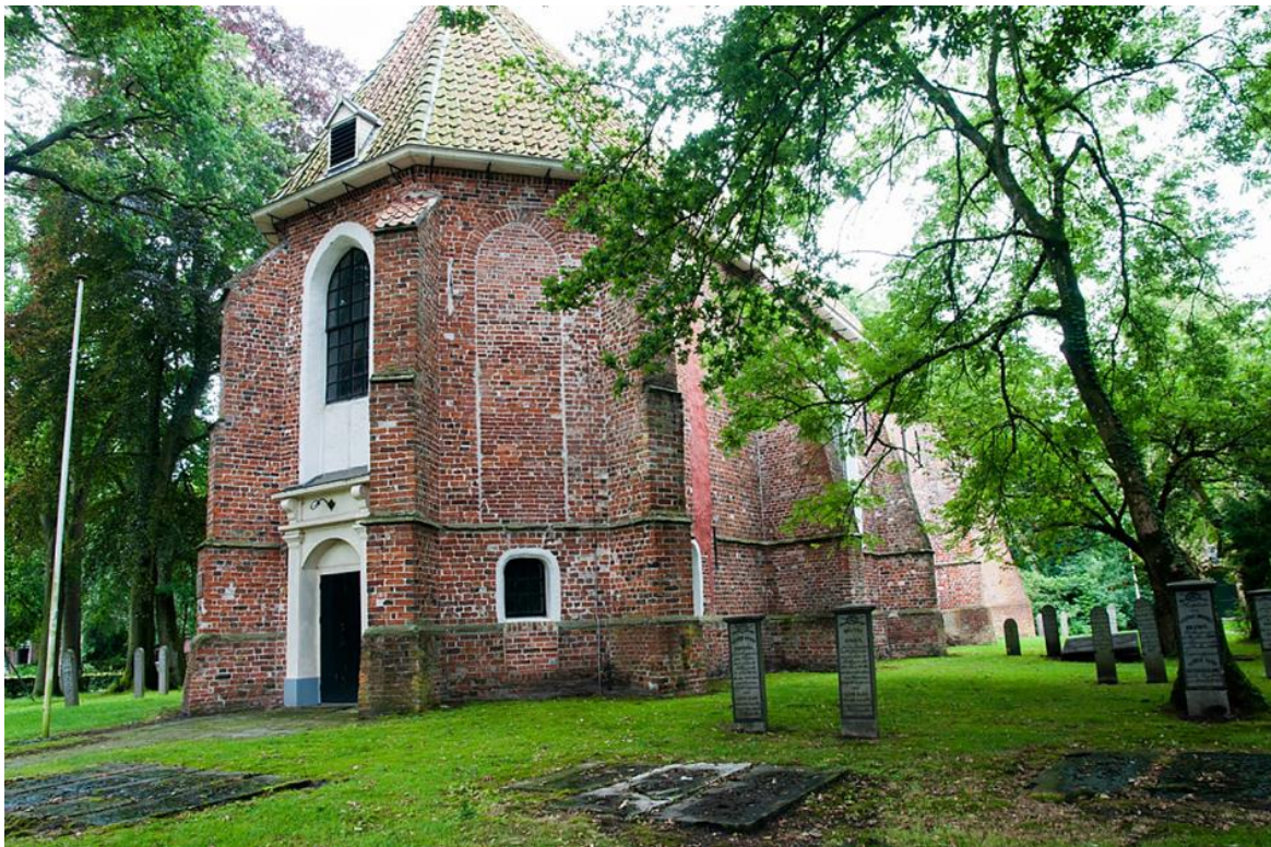
Magnus church, Bellingwolde, 1527