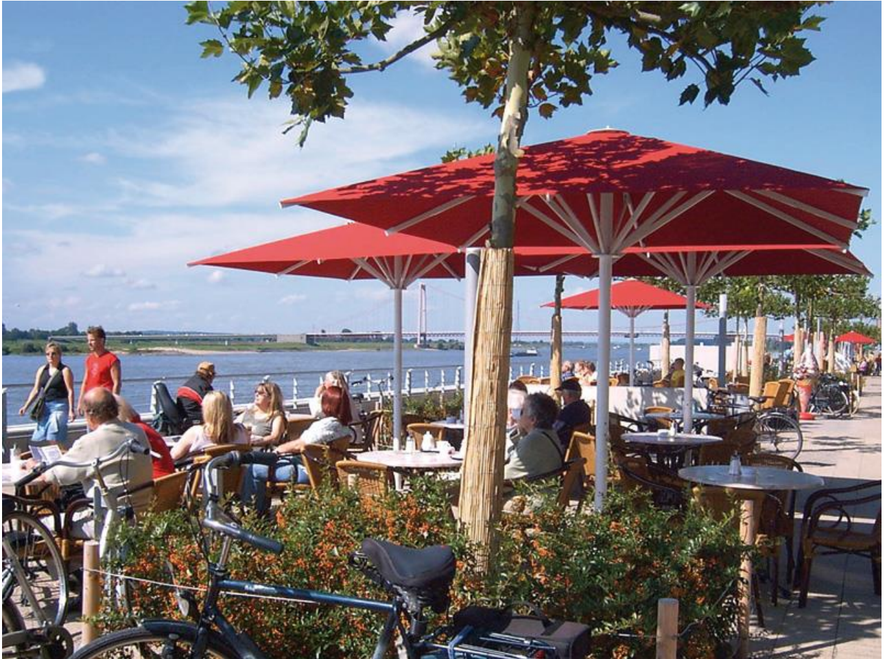
resting on the Rhine. The finish!