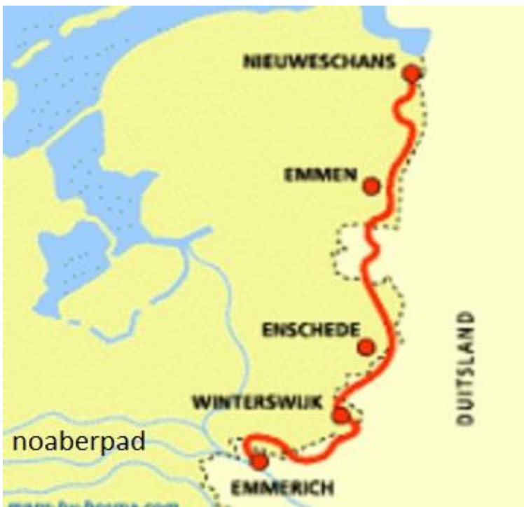
the dotted line is the border Germany-Netherlands (left)