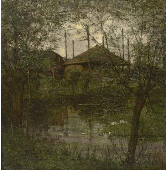
Mondriaan, Haystack with willow trees