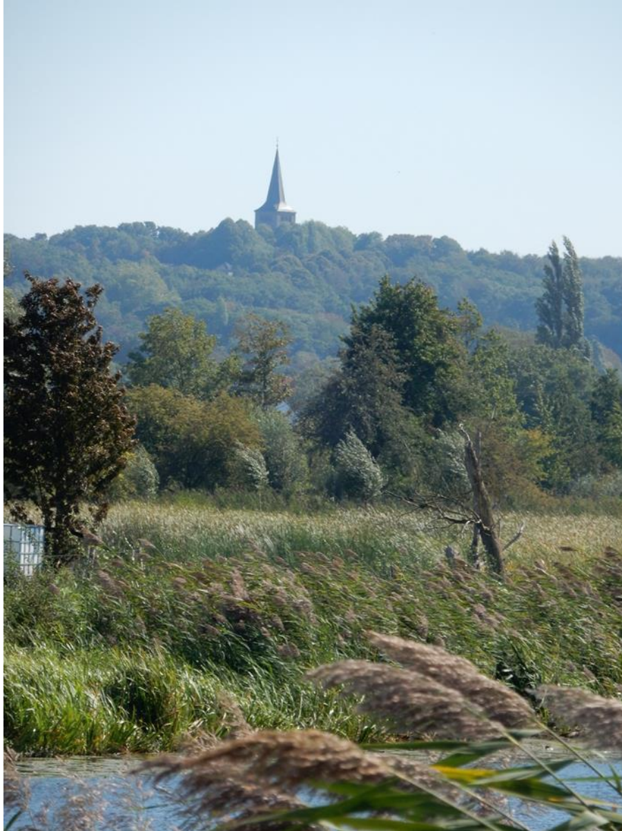
Hoog Elten, St Vitus church

At the top of Hoch Elten you have already seen and shadow of the Rhine. At Spijk you walk the final stage of the Noaberpad along this river.