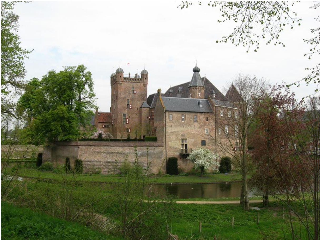
Huis Berg/ Berg Castle

On the Galgenberg, part of Huis Bergh in ' s-Heerenberg , it goes straight south. Through a wooded area.