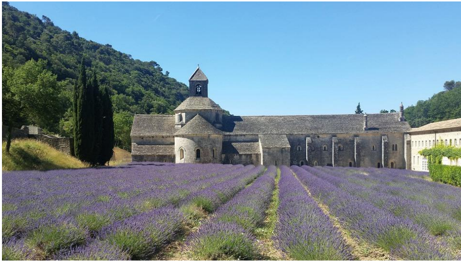
the Abbaye Notre-Dame de Sénanque

The walk goes through ochre-colored forests, hilly, from surprise to surprise, where the color combination of the bright blue sky, the dark green pine trees and orange shapes in and on the earth will stay with you. I guess. The last stage to Fontaine de Vaucluse goes along the Abbaye Notre-Dame de Sénanque. Founded in 1148 and known for a turbulent and bloody history. Currently a contemplative community of praying Cistercian monks. The pictures of the abbey with the blooming lavender in the monastery gardens are world famous. A community of a completely different order is les Bories et Spa : a "well-being stay" in which the floor is mainly determined by the wallet and the luxury offered. This way you walk from one extreme to the other.