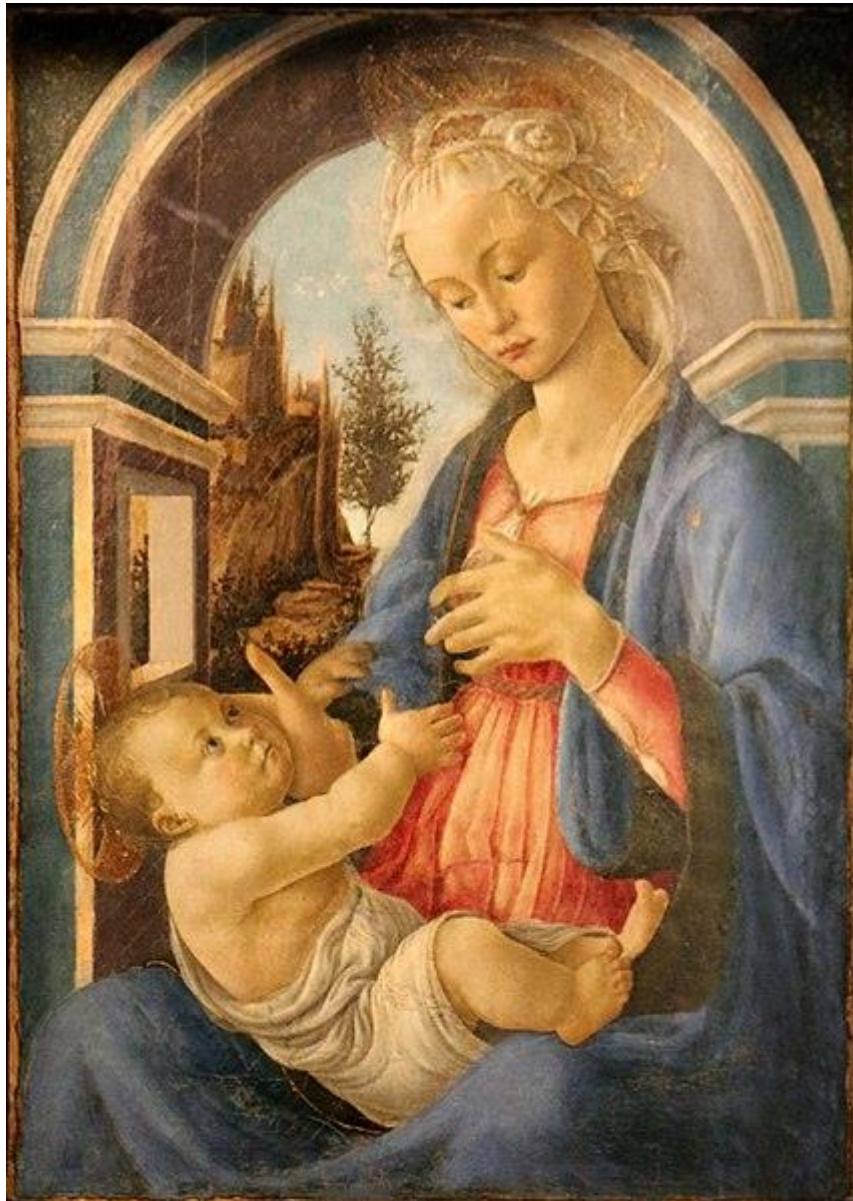
Musée du Petit Palais. Botticelli. Madonna and child.