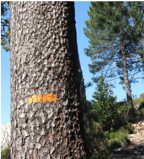
The marks of de Mare a Mare Sud