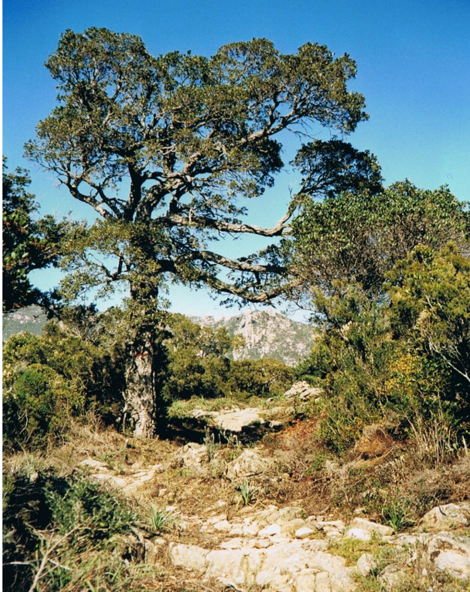
Ascent and descent, on paths with loose pebbles