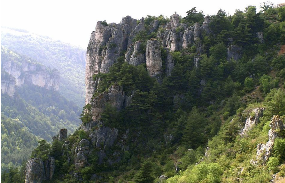
Gorge de la Jonte