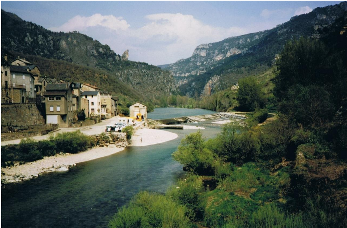
the Tarn at les Vignes

A hike through the Cevennes, a mountain range in the Massif Central, over the plateaus of les Grands Causses and through the deep ravines of the Tarn, the Dourbie and the Jonte. And all this in an almost circular walk of six day stages with about 15-20 kilometers per day. You rarely can get it better!