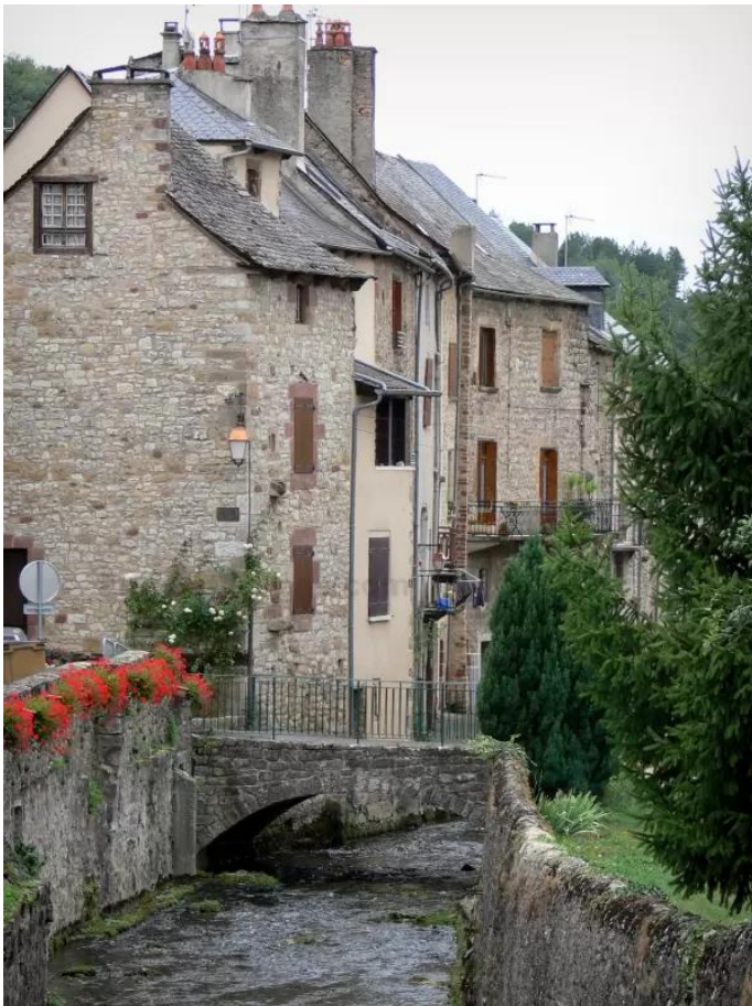
La Canourgue, Urugne river