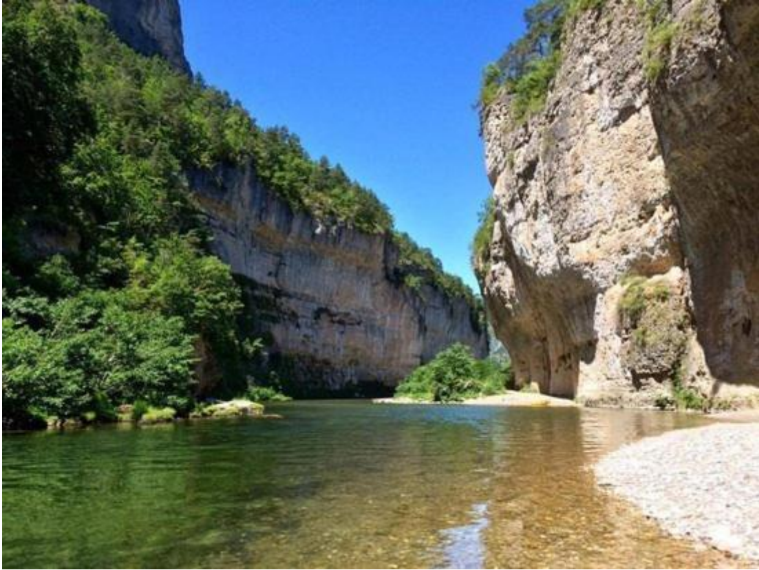
St George de Lévéjac