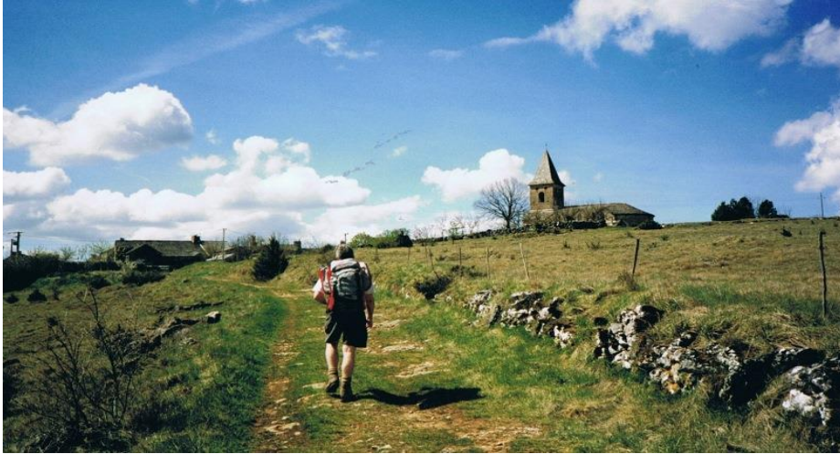
Veyreau Causse Noir