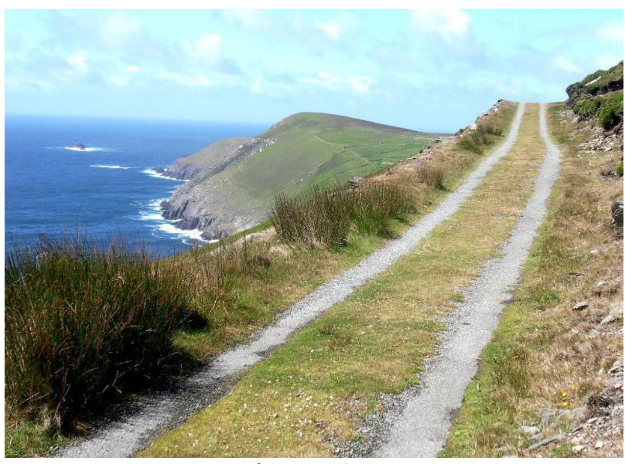
frequent sea views