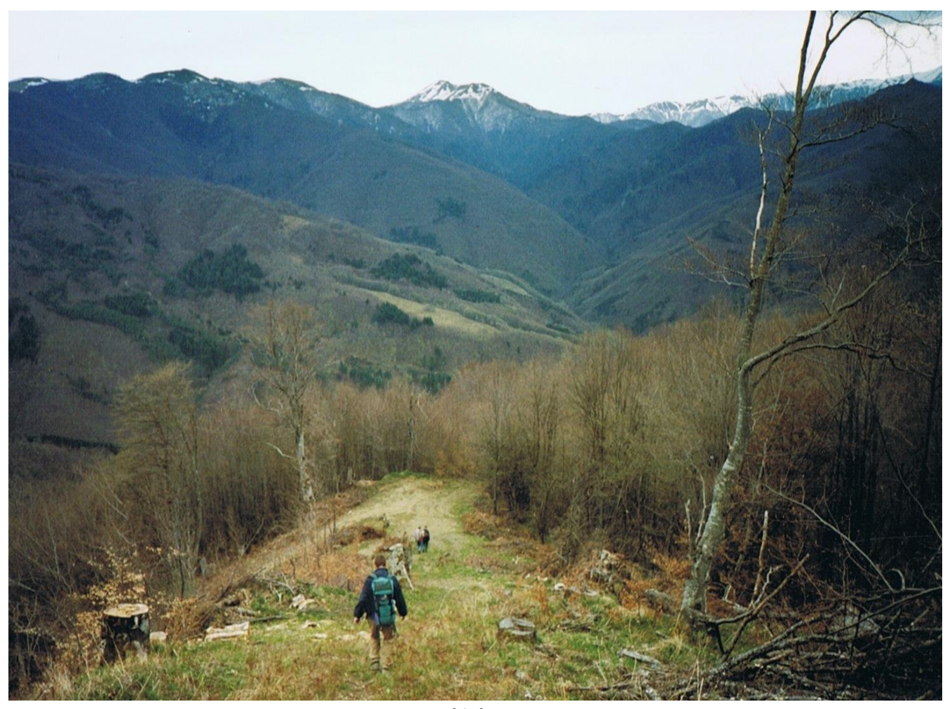
Descent to Shipkovo