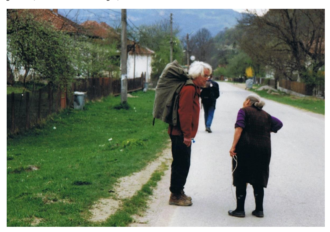
Meeting along the way

"Nature is beautiful here, but we need people" and "It used to be very lively, you had a bakery, clothing stores, there were weddings", it is often heard. And to read.