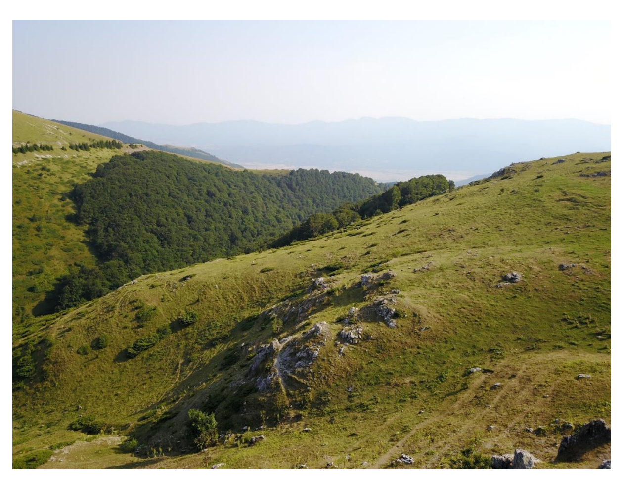
Beklemeto pass Bulgaria 1520m