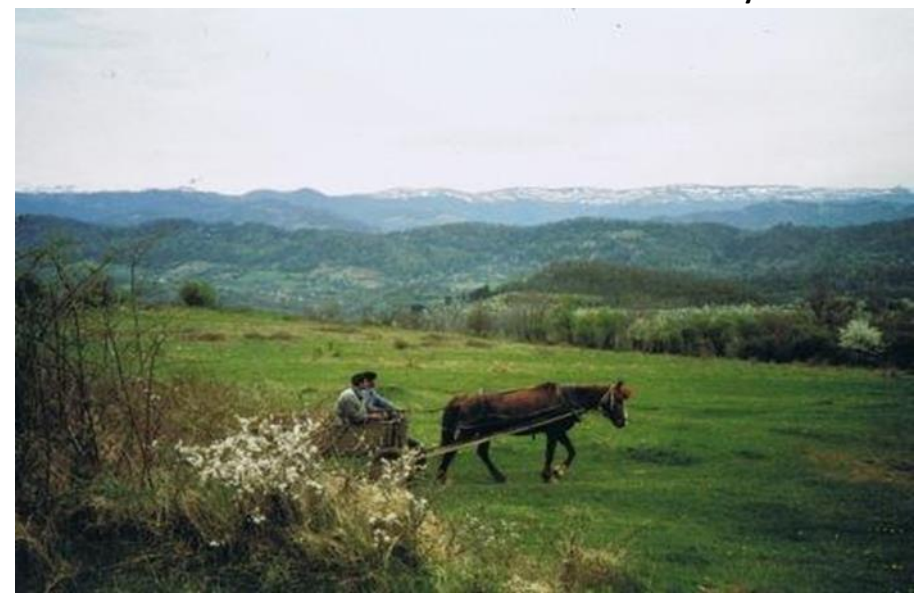
Roma om horse