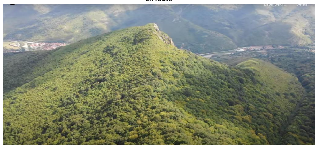
view from Glozhene Monastery