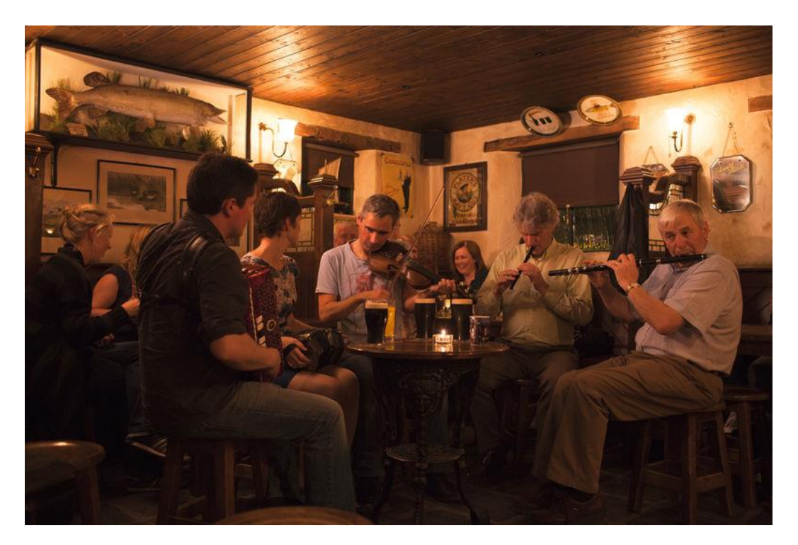
Folk music in a pub

It is recommended to read up on the special world of Irish mythology at home. But some foreknowledge of more recent history, including the relationship between Ireland and England, can't hurt either. Especially in the pub, when the alcohol is going to contribute to the conversation with a proud Irishman.