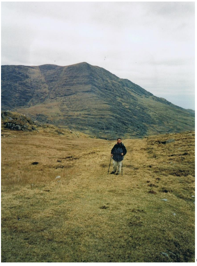
On your own