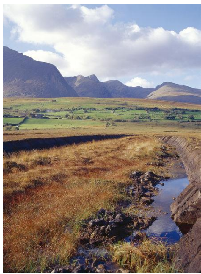
Mount Brandon, Dingle

You can climb the mountain peaks, but if you prefer to take it easy, you can also walk around them. The most famous and most walked hiking trails are named after the names of the peninsulas. These hiking trails often avoid the higher peaks of the mountains, making them easy to do for most hikers. Classics include the Dingle Way, a 179-kilometre signposted circular walk. There is also the Kerry Way, a 214-kilometre route that starts and ends in Killarny. And the Beara Way, a 206-kilometer National Irish Trail, should not be missed in this list. But, as mentioned, if you feel like a nice climb, that is at least easy to realize at breakfast in the B&B.