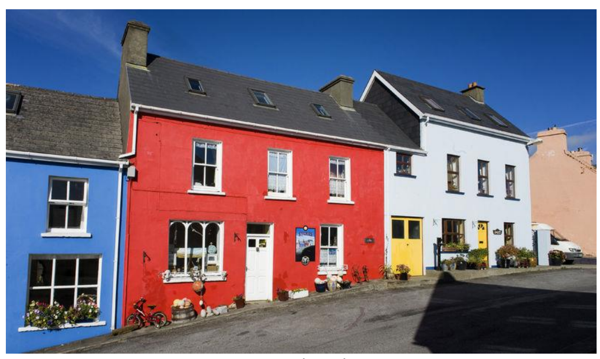
Eyeries ( Beara)