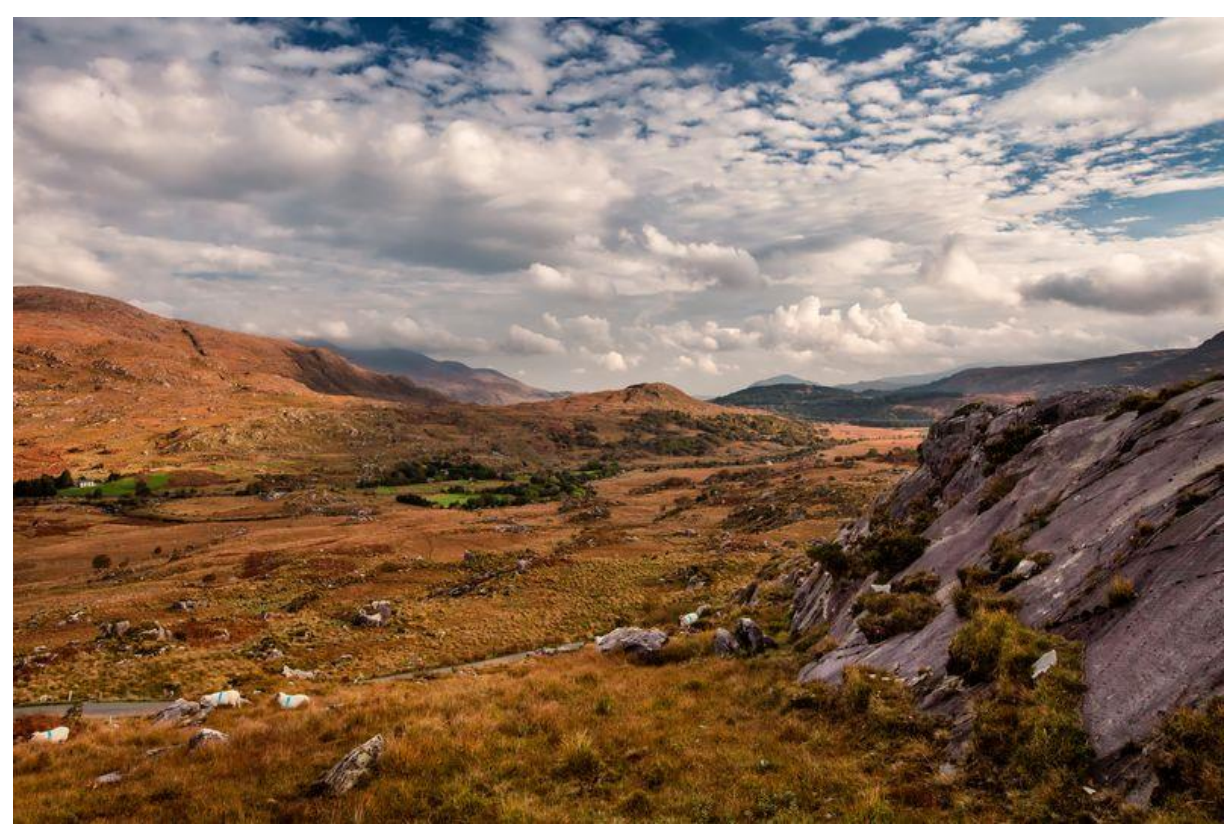
Black valley Kerry