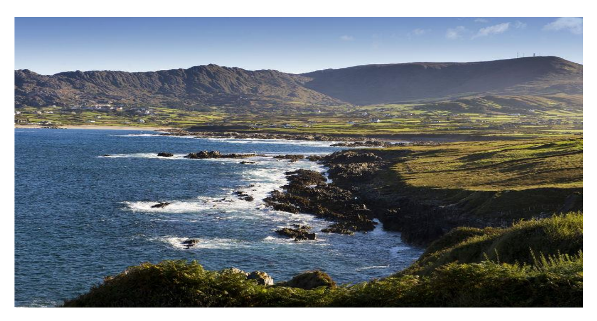
Slieve Mish Mountains

The Caha Mountains and the Slieve Miskish Mountains form the backbone of Beara. The highest mountain of Beara is Hungry Hill (685 m). In addition, the Macgillicuddy's Reeks, with (three) peaks up to more than 1,000 m, are iconic for the Iveragh peninsula. On Dingle, this honor goes to the Brandon Group, with the Brandon as the highest mountain: 952 m. This nature on these mountains and the already mentioned rocky coasts (and sometimes beautiful sandy beaches) is not only rugged and wild, but can also be described as lovely and picturesque. It is not without reason that the Irish landscape has been a source of inspiration for countless singers and poets for thousands of years.