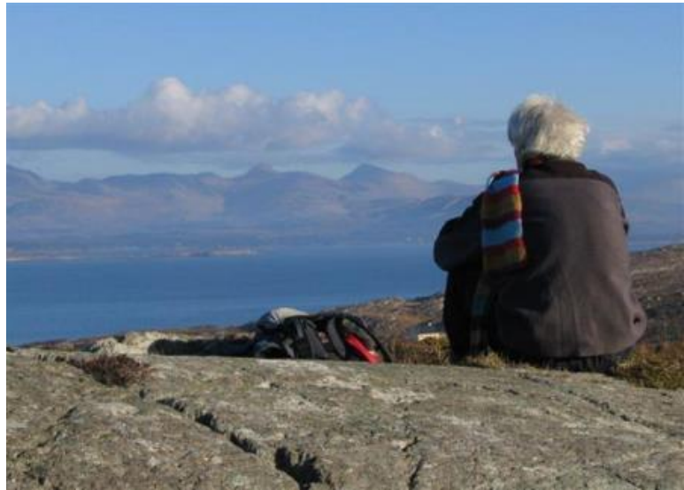
Overlooking Kenmare Bay