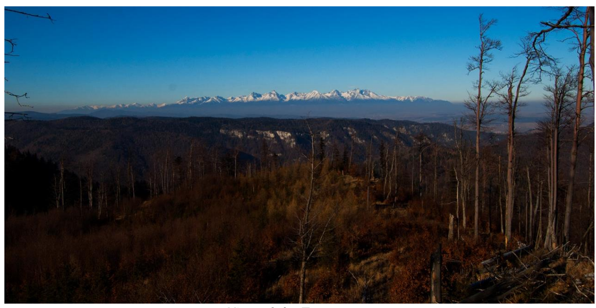
View of the Tatras