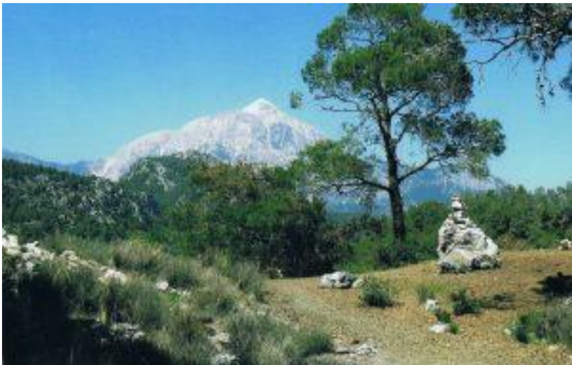
Lycian way, view of Mount Olympos

Foto en tekst Hans Plas, www.oranginas.nl