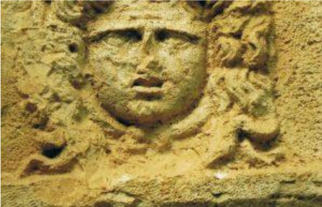
Lycian way, effigy on a Lycian tomb

Where, by the way, via the E4 that runs over that island, you pass the place where Paul came ashore again. And what a place! Not to mention the Genoese, the Arabs, the Venetians... or the Bishop of Myra. Indeed: he is not from Spain but from Lycia. It's still there. At least a particle. In the middle of the current, ubiquitous and prominent, symbols of Islam.